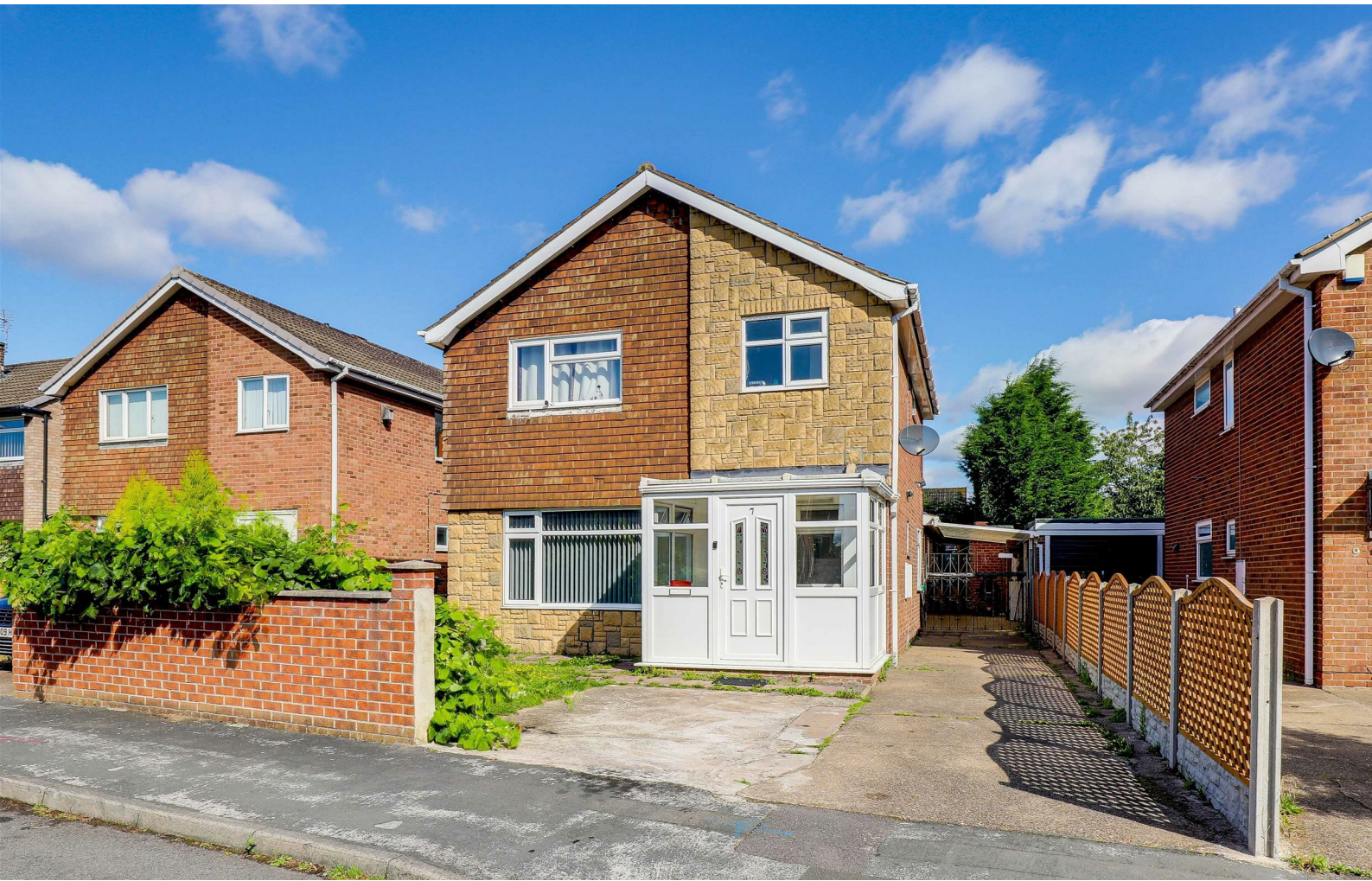
Bromfield Close, Bakersfield, Nottinghamshire NG3 7HH